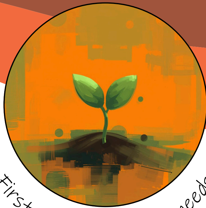
First to see emerging needs