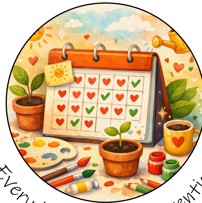
Everyday informal prevention

Working for thriving communities across Maldon District