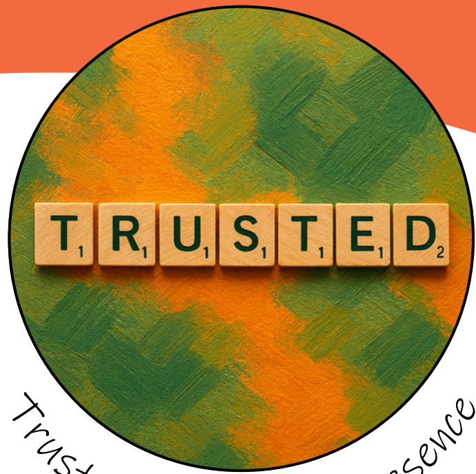
Trusted community presence