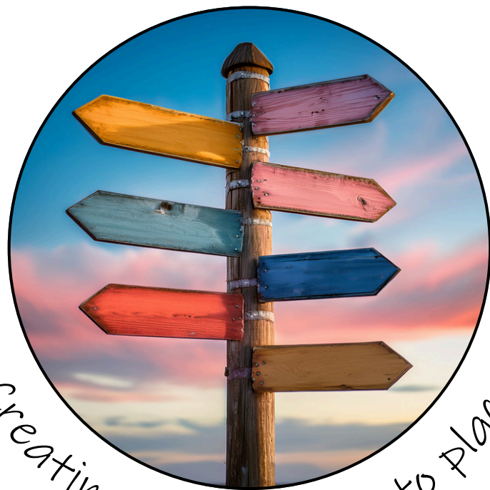
Creating a connection to place