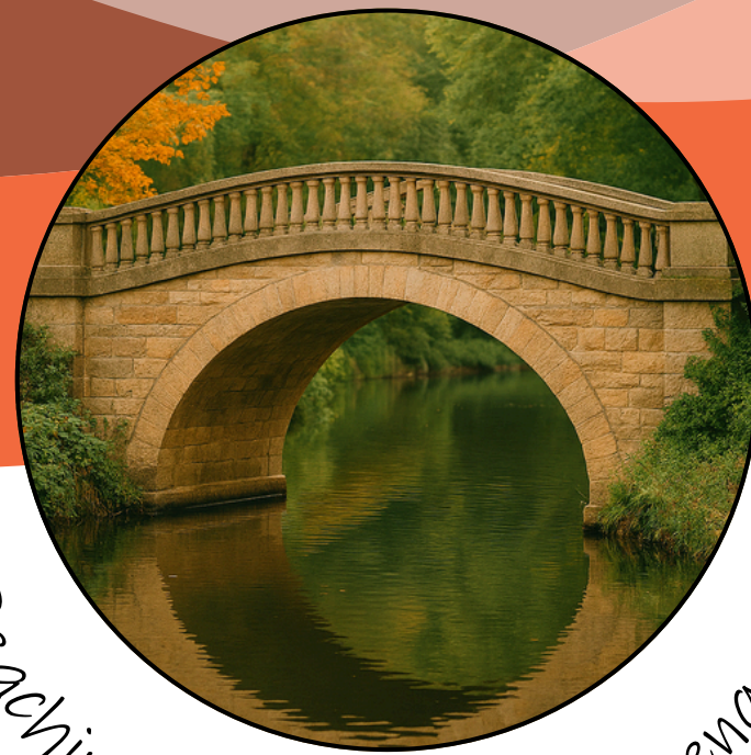
Reaching people who don't engage